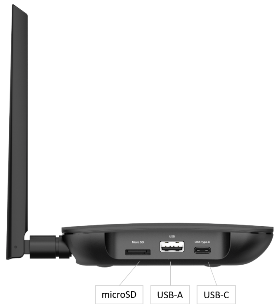
X700 Key Peripheral Ports