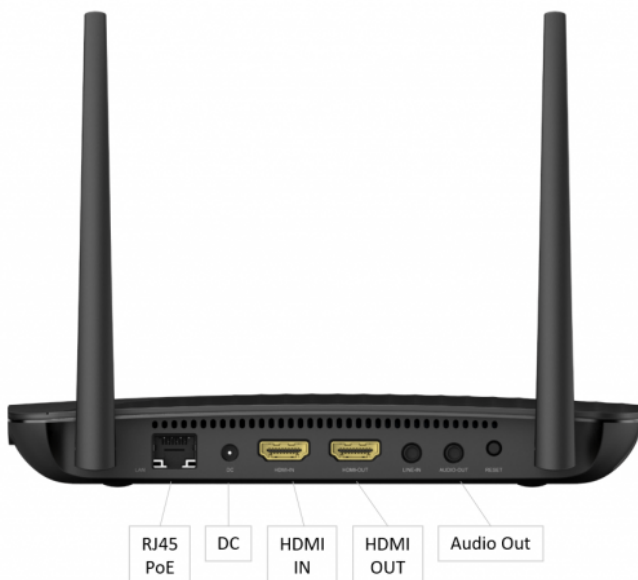
X900 Key Peripheral Ports