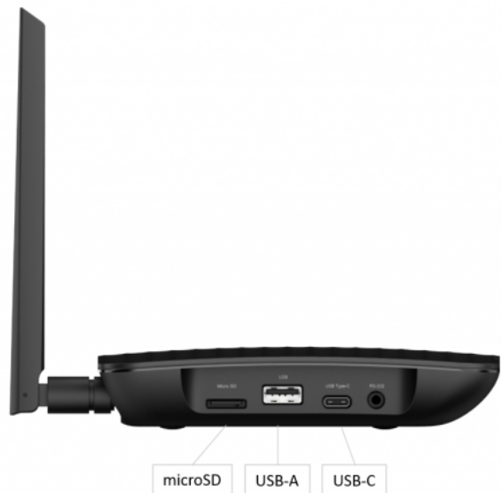
X900 Key Peripheral Ports