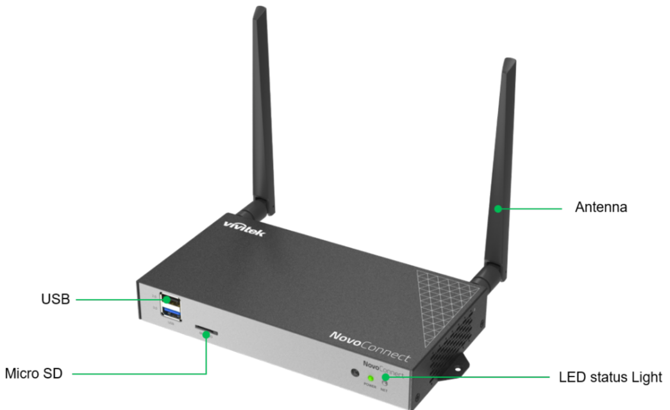
NC-X710 & NC-X910 I/O Ports in front side