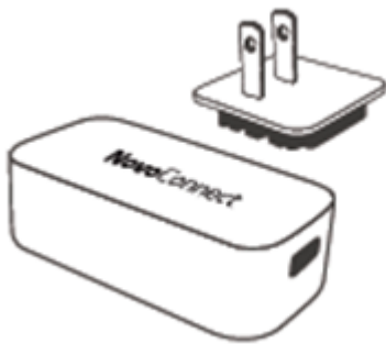
AC-DC Adaptor with Changeable Plug

The AC-DC power adaptor comes with several types of plugs, one of which should be suitable to the power outlets used in your country or region.