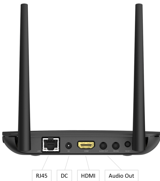
X700 Key Peripheral Ports

Installing X700 or X900 is very simple and straight-forward. The following two figures summarize the key peripheral ports available. (You may refer to the Quick Start Guide for details.)